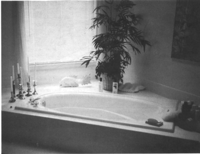
Aromatic candles in this designer bathroom might look elegant, but because they contain a high concentration of oils, they are causing soot deposition throughout the home.